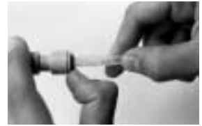
Figure 12 Removing Tubing from fittings

⚠ The unit MUST NOT be operated without a filter element except when sanitizing (page 8).